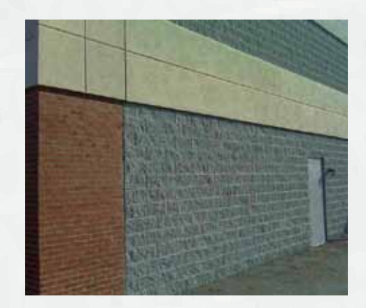
CEBU STONE® 219B Industrial Drive, Clarksville, Tennessee 37040 WWW.CEBUSTONE.COM